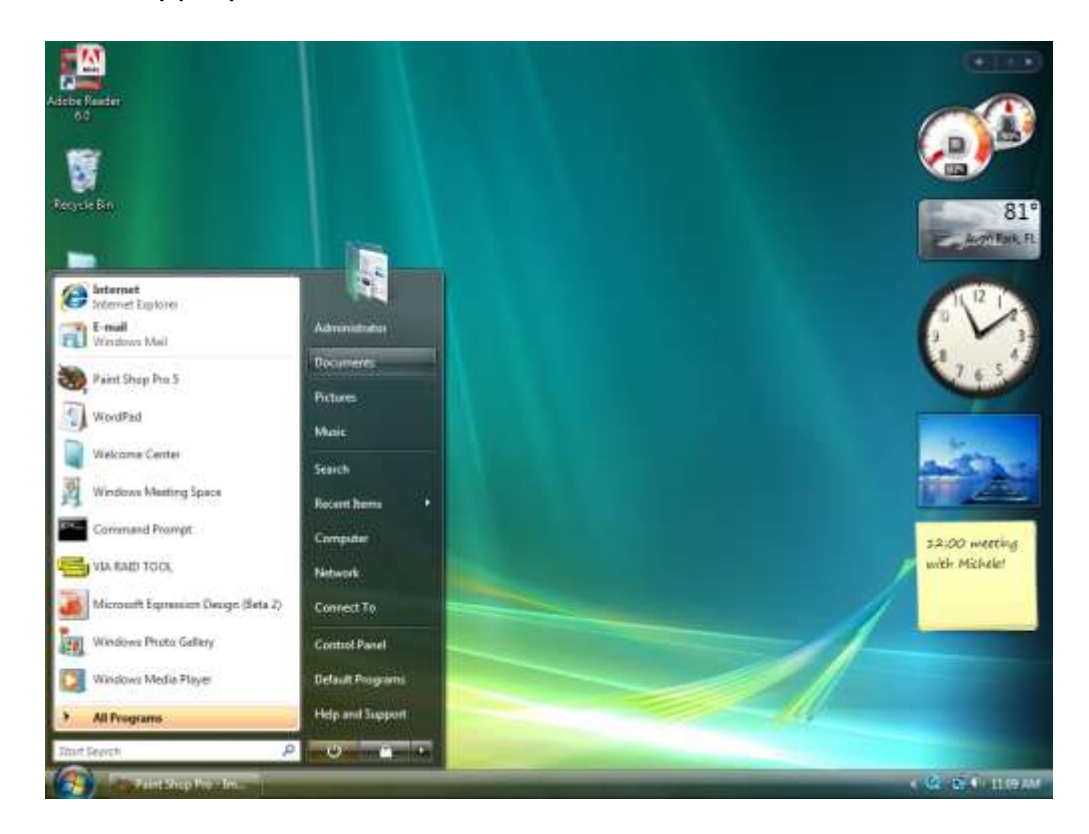
Figure 1 - Vista Business Edition desktop. Note the Gadgets toolbar on the right side of the desktop.

Upgrade Advisor, which will do a complete scan of the existing hardware and software on a PC to determine if it can be successfully upgraded to Windows Vista, as well as identify which edition would be the most appropriate.