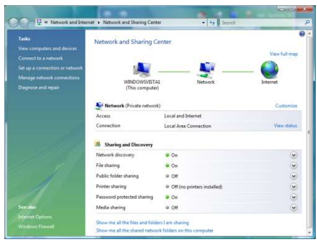
Vista Networking and Sharing Center

Look at the screen capture of the Network and Sharing Center. Look at the "Network discovery" option in the " Sharing and Discovery " section of the dialog box which is one of the many new features available.